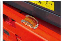
Emergency falling and dual flashing warning lights