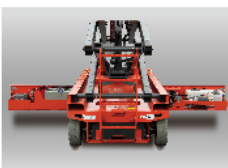
Rotary maintenance pallet