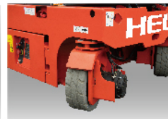
Small turning radius