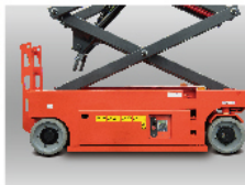
Auto-protection on holes on the ground