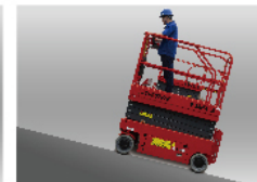
Strong climbing ability